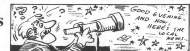
An American radio engineer and pioneer of radio astronomy, Karl Jansky, discovered radio emission from the Milky Way.

Now can you imagine what the Gentiles felt in their hearts when they read and heard for themselves that no longer would they have to sit in darkness, no sitting in the