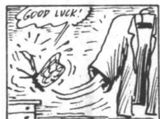
Some people believed it good luck for a butterfly to fly through their coat sleeves.

The Warrior J.V.'s now sport a 4-3 record.