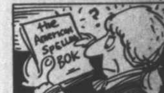
In 1783, Noah Webster published his "American Spelling Book." Its estimated sales in the next 100 years were 70 million.