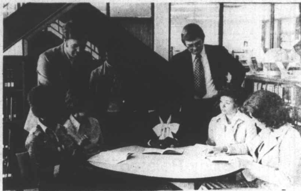
Pictured above is the Robeson Technical Institute Staff Members who are working full time with county's functional literacy program. Seated from left