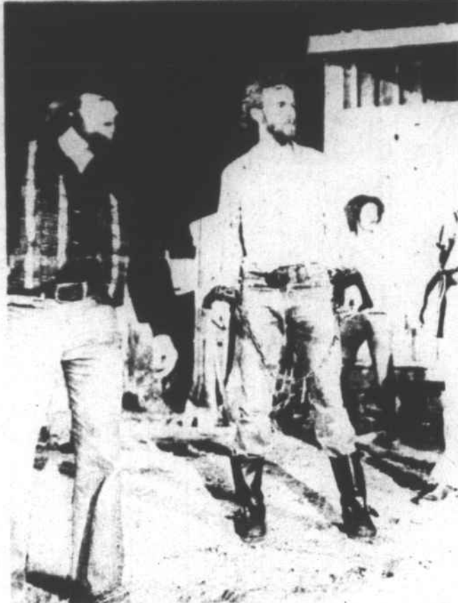
SCENE FROM 1977 production of musical outdoor drama "STRIKE AT THE WIND!". Auditions for this year's show will be held on Sunday, March 19 at 2 p.m. at the Lakeside Amphitheatre site of the show on the Riverside Country Club 3 miles west of Pembroke. Experience is not necessary; singing, dancing, acting and technical jobs are open to all ages. PSU students may receive college credit for their participation along with the summer's pay.

In case of rain, the tryouts will be held on Sunday, April 2 at 2 p.m. at the theatre.