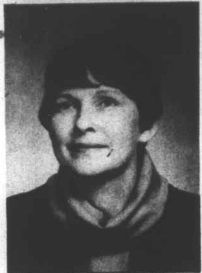
ROBESON COUNTY BOARD OF EDUCATION Paid Political Ad