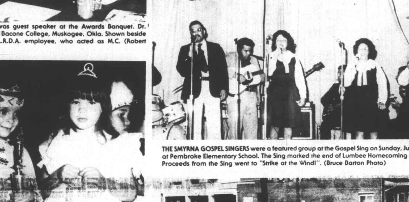
THE SMYRNA GOSPEL SINGERS were a featured group at the Gospel Sing on Sunday, July 2nd at Pembroke Elementary School. The Sing marked the end of Lumbee Homecoming 1978.