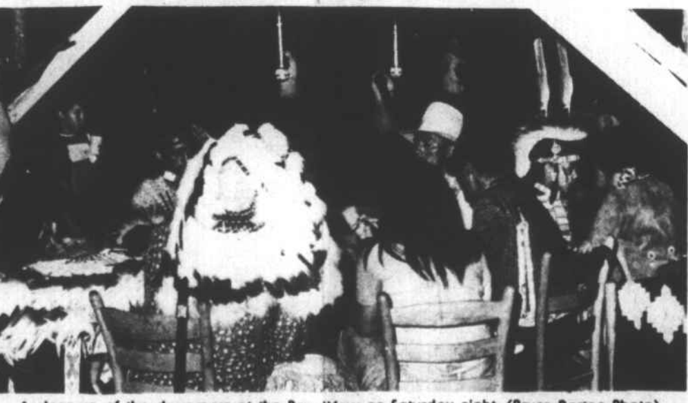
A close-up of the drummers at the Pow Wow on Saturday night.