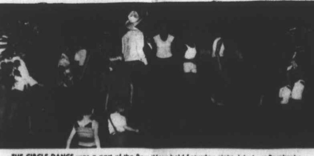
THE CIRCLE DANCE was a part of the Pow Wow held Saturday night, July 1, at Pernbroke Senior High School's athletic field.