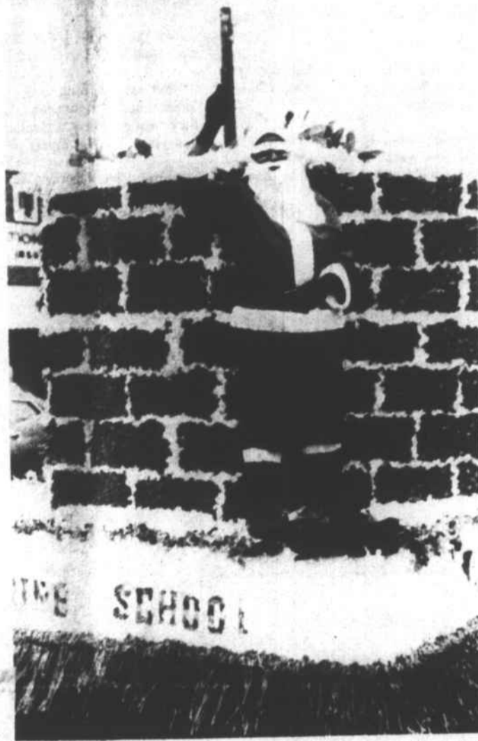
Santa appeared at the Christmas parade in Pembroke last Saturday. The parade is sponsored annually by the Pembroke Jaycees. Santa has appeared every year—so far! Sundry beauty queens, floats, marching bands, etc. appeared. A large crowd turned out to watch the parade.