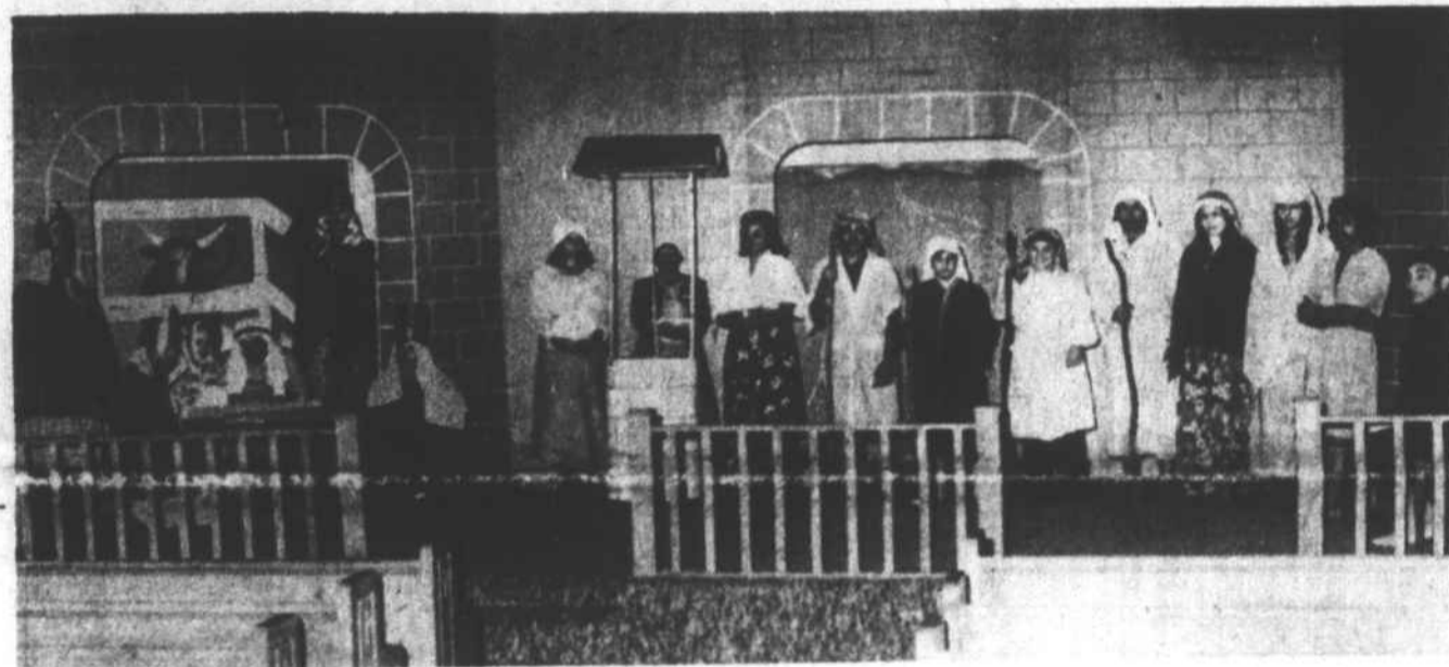
White Hill Free Will Baptist Church