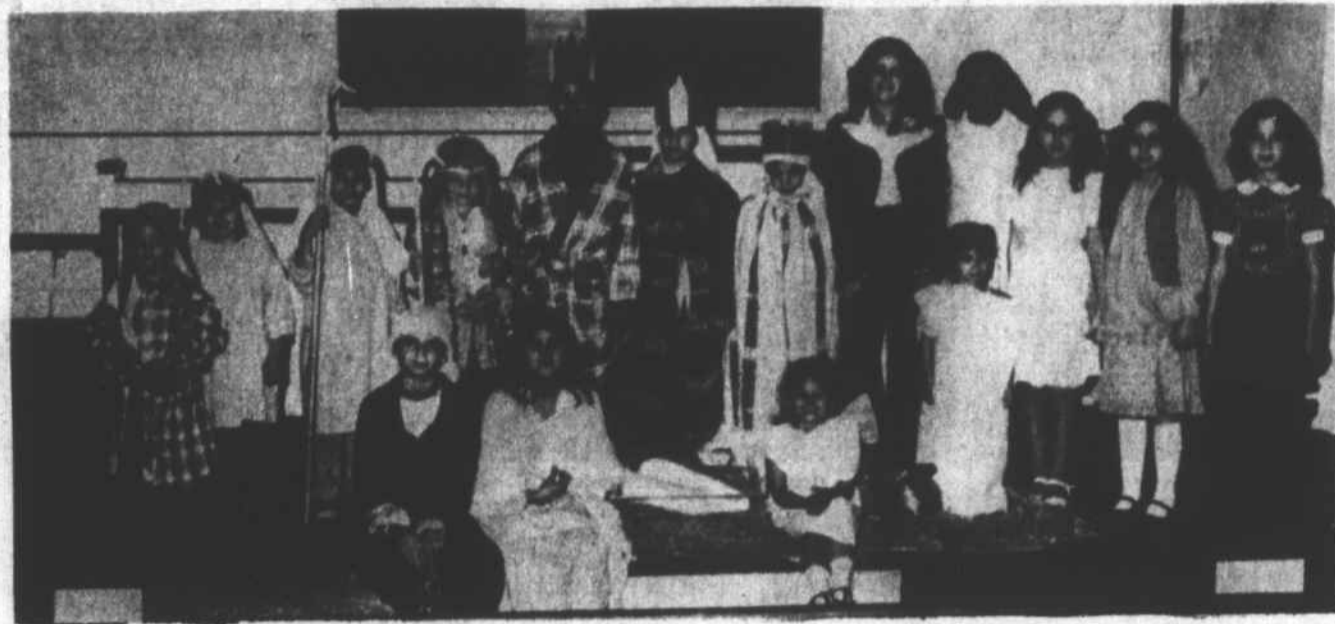
First Baptist Church in Pembroke