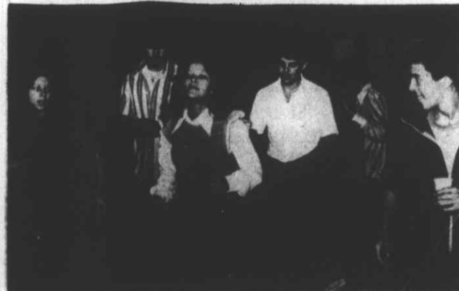
And at the Magnolia High School Career Education Club Students'