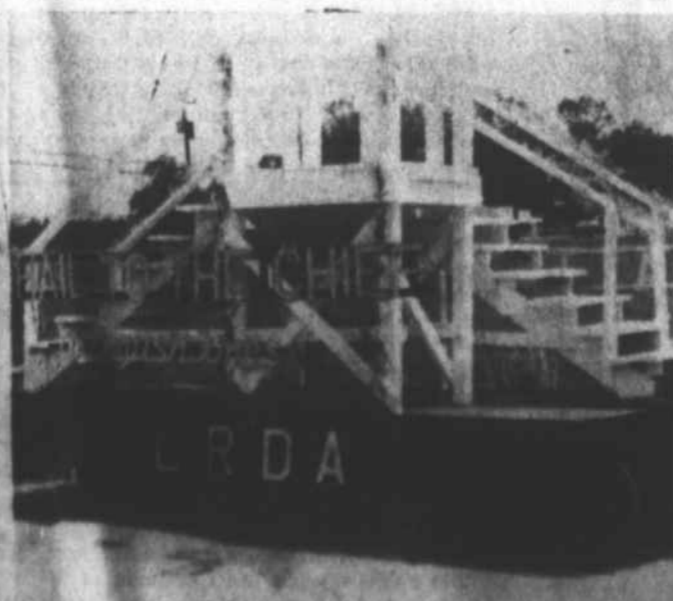
LRDA's Entry was one of many in the Parade Friday morning. In the parade this float was peopled with pretty employees of Lumbee Regional Development Association, Inc. (LRDA) This entry (complete with the pretty girls) won first place in competition among the float entries