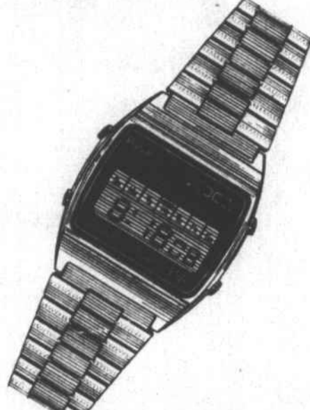
LC Digital Chronograph with Dual Counter System JJ001 $79.50