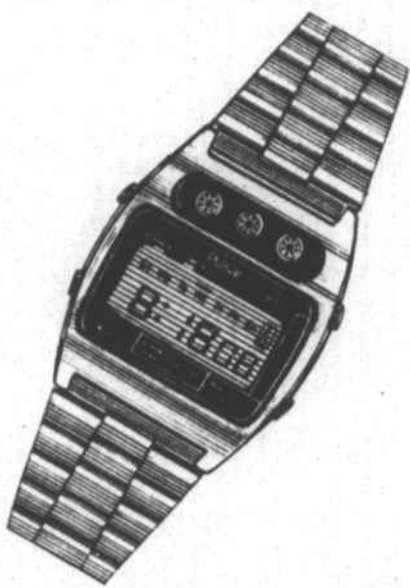
LC Digital Alarm JK001 $85