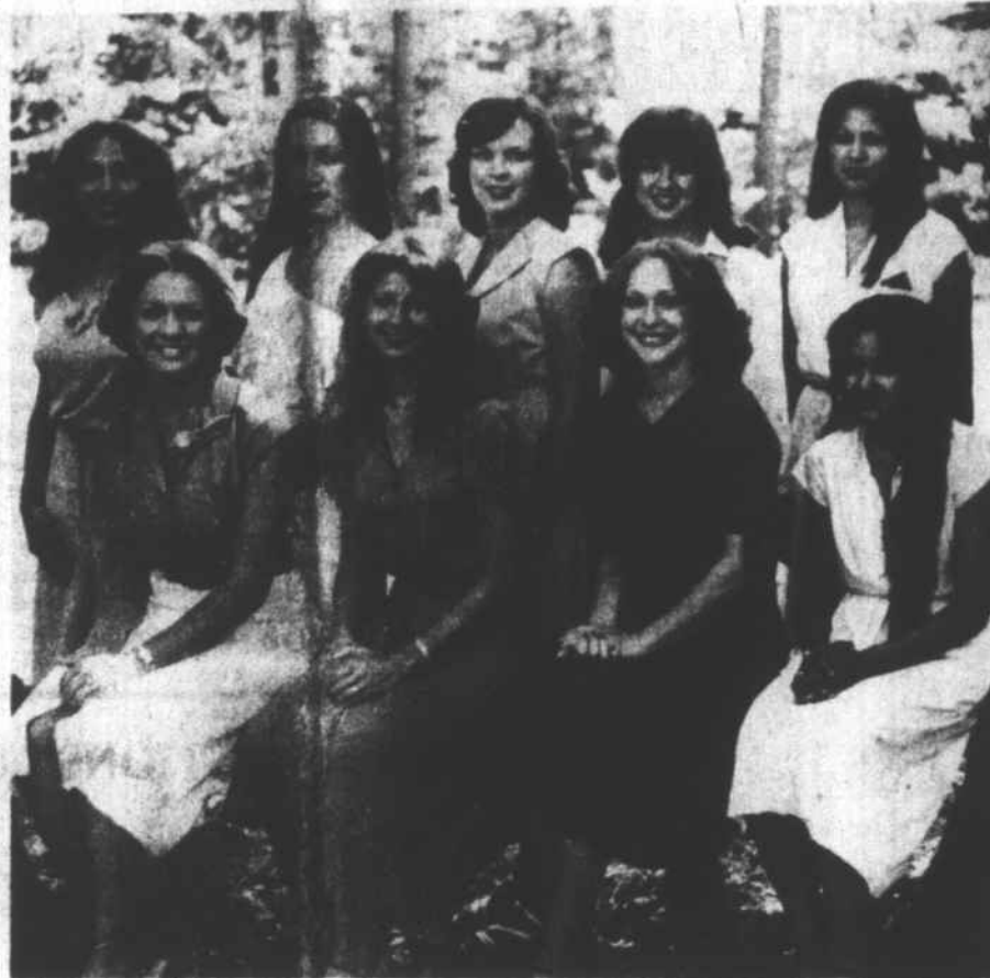
These ten lovely young ladies are rehearsing their talents and roles for competition in the 12th Annual Miss Lumbee Pageant to be held July 6th at 8 p.m. at the Performing Arts Center of Pembroke State University.