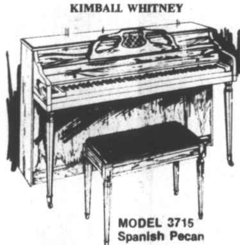
Piano & Bench-$1,188.00

TRADE NOW-NO CASH DOWN PAYMENT NEEDED WITH TRADE-IN