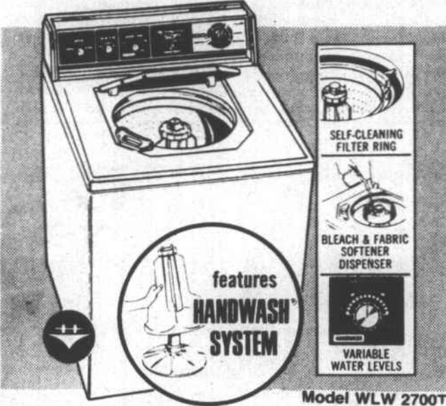
Model WLW 2700T

WITH A RUGGED AGITATOR FOR HEAVILY SOILED LOADS PLUS A GENTLE AGITATOR FOR SMALL LIGHTLY SOILED LOADS!