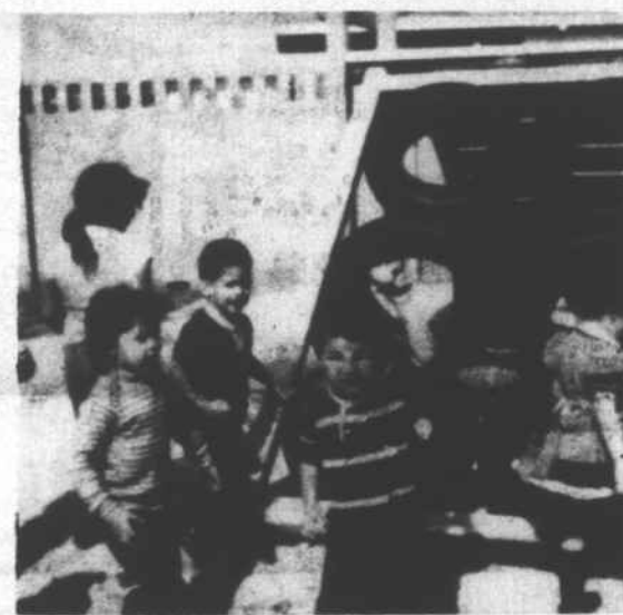
Looking for eggs.