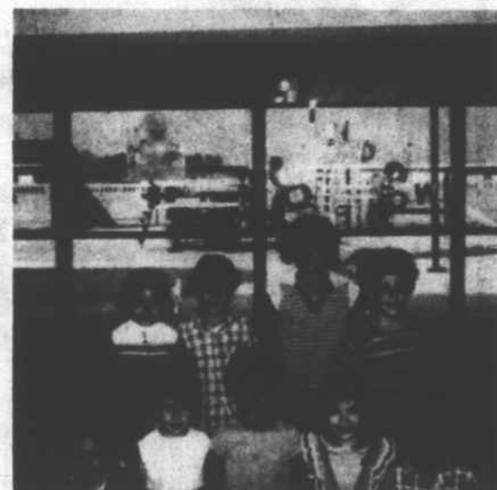
4 and 5 year olds.