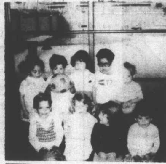
2 Year Olds.

The Clinton L. Thomas, Jr. Day Care Center celebrated Easter with an old fashion Easter Egg Hunt, followed by an Easter Party, given by the staff.