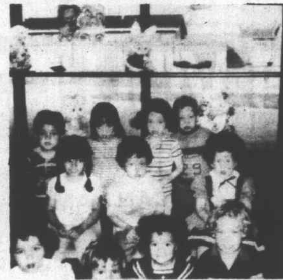
3 year olds.