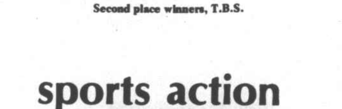
Second place winners, T.B.S.