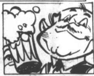
Researchers say tolerance for alcohol decreases with age.

Most Powerful AM Station In Robeson County, N.C.