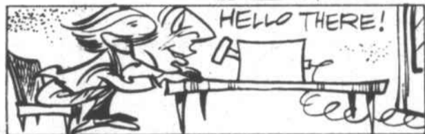
Thomas Edison introduced the use of "hello" as the standard telephone conversation opening. At first, people would preface phone calls with such phrases as "Are you ready to talk?"