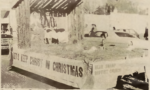
Bear Swamp Baptist Church's float reminded us to "Let's Keep Christ in Christmas."