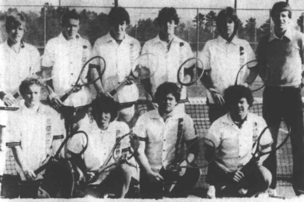
1981 Pembroke State University men's tennis team.