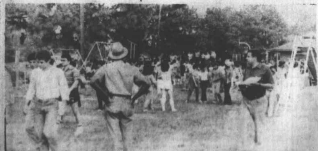
Part of the crowd that turned out Friday for our barbecue plate sale included some 200 youngsters...