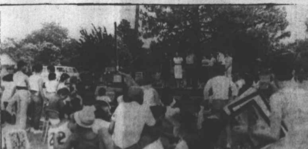
Cast members from the upcoming production of 'Strike at the Wind!' provided a mini concert of music heralding the 6th season of the popular outdoor drama