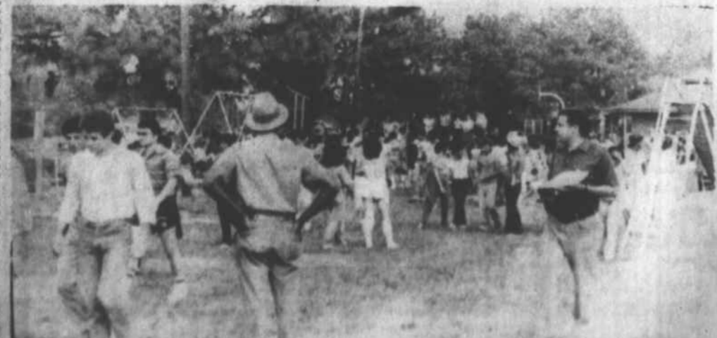
Part of the crowd that turned out Friday for our barbecue plate sale included some 200 youngsters...

LUMBERTON -- Nominations for three Cumberland County vacancies on the Cardinal Health Agency Board of Directors are being accepted. To comply with state law, the board members must have certain characteristics.