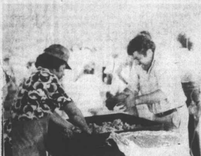
A total of fifteen hogs were donated to us to use in our barbecue plate sale...