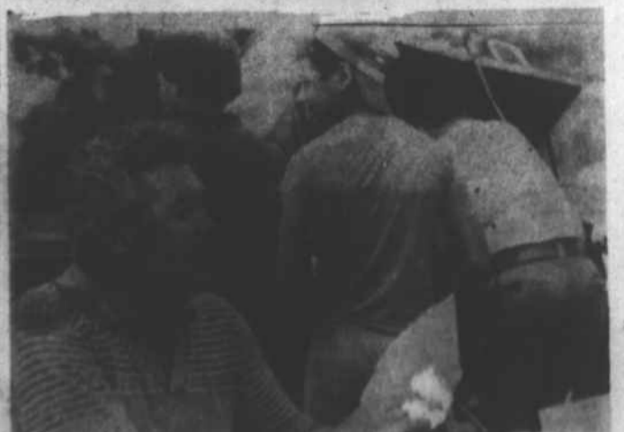
I attempted to collect the intermittent rains that his-mones and bemoaned the dews but did not stop us.