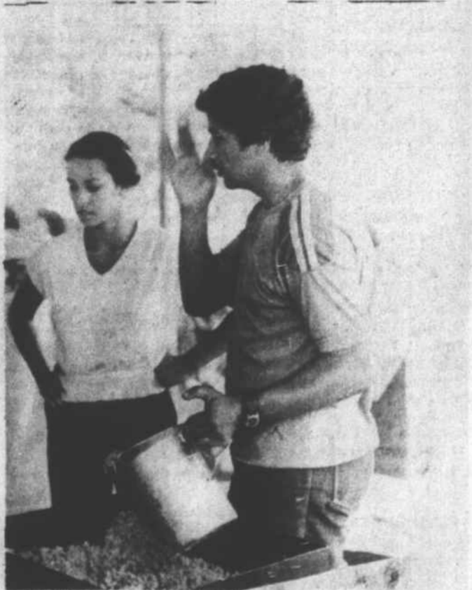
Also helping during the festivities in the park last Friday were Miss Lumbee and a member of the Pembroke Jaycees.