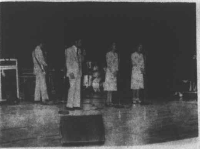
An old fashioned Gospel Sing closed out Lumbee Homecoming Sunday afternoon in PSU's Performing Arts Center.