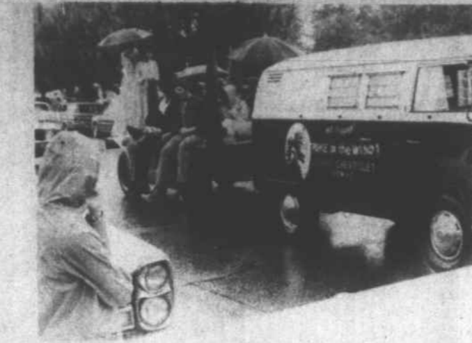
"Strike at the Wind!", our popular outdoor drama, was also in the parade. The drama opened Saturday night to kick off its 6th exciting season.