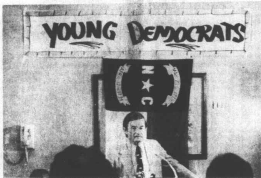
Congressman Rose addressing N.C. Young Democrats at the "Downeaster" Democratic Rally.