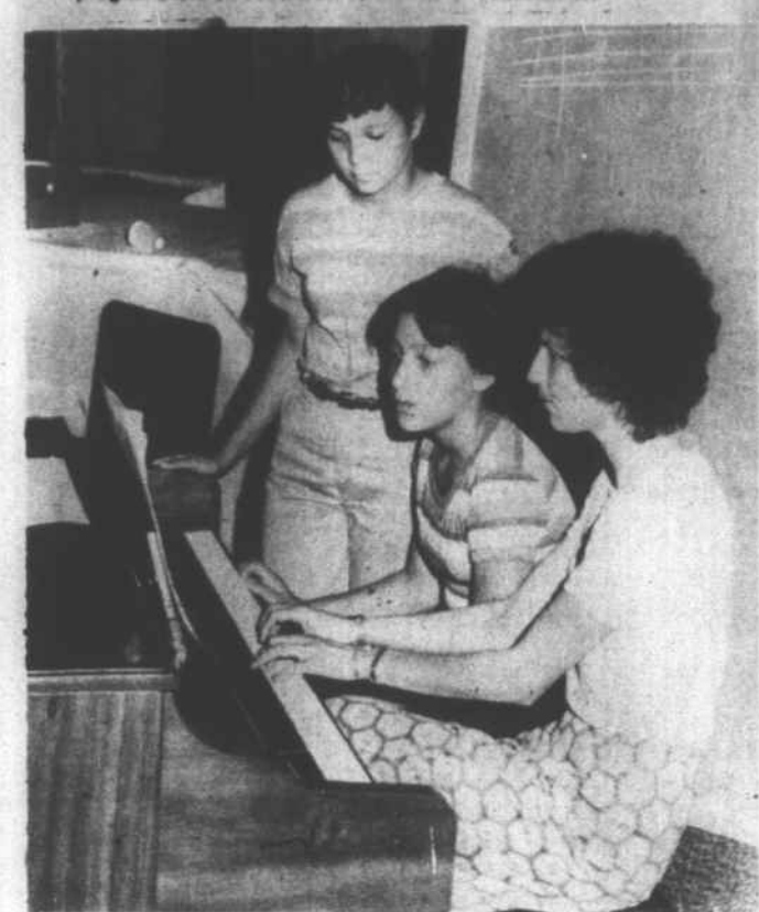
PIANO CLASS IN SESSION.

Several contemporary instrumental groups as well-as a chorus will be organized by the directors. Both groups will organize four public performances throughout the year in Robeson County as well as be evallable for tours. Many of the public performances will be in the public schools so that other students become aware of the Center and so that the programs will be accessible to the Indian communities.