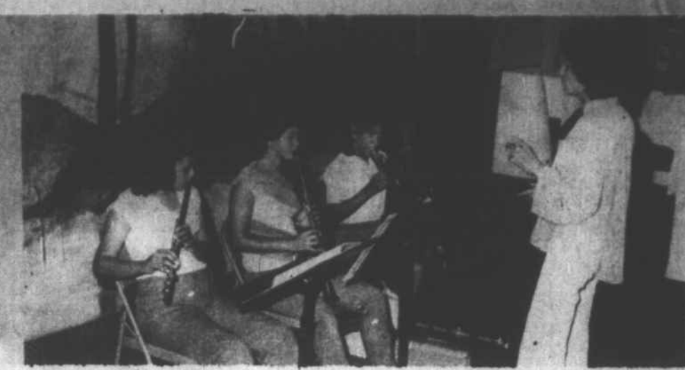
BAND STUDENTS PRACTICE.

The Center will be holding auditions for the 1981-82' academic year in September. Any student interested in joining the Center for the Arts should contact their high school guidance counselor in September, or call the Center for the Arts office at 521-2401. Interested students must fill out an application and audition for the areas they are interested in. The auditions are judged by a panel of professionals in the given area, and are held, with the exception of dance, which is held at the LRDA Annex, at local high schools.