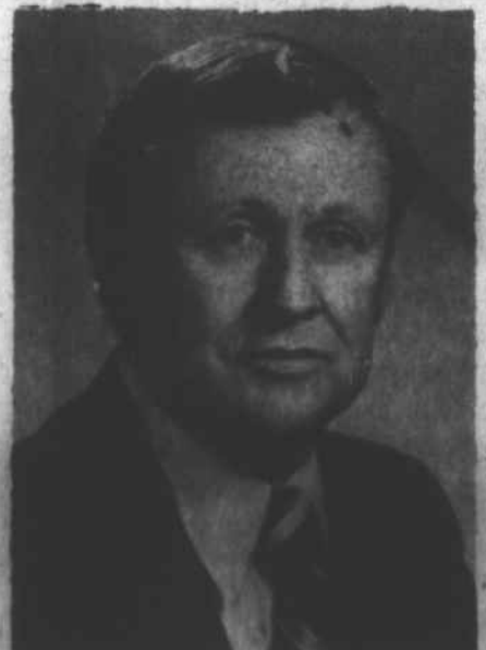
Rep. David Parnell

During the 1981 session of the Legislature, Parnell was Chairman of the House Base Budget Committee on