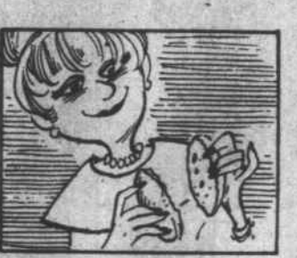
English muffins freeze well but separate the halves before freezing for easier

and its resources. Since the Lumber River has always been here, Sherwood has felt with legitimate cause that a majority of local citizens have