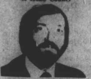
N.C. HOUSE of REPRESENTATIVES