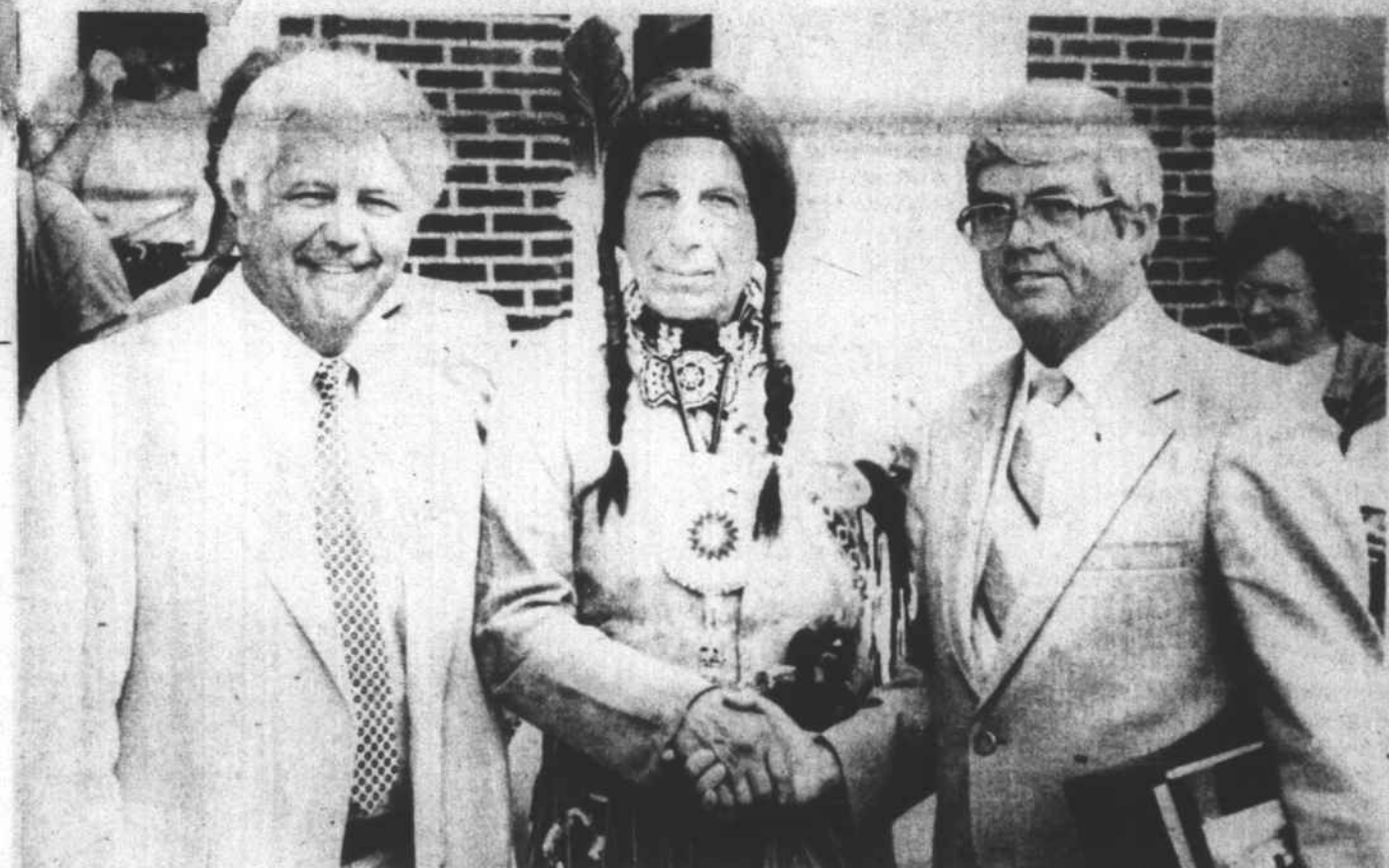
Iron Eyes Cody (center) shown shaking hands with PSU Chancellor Paul Givens at the Wednesday morning ceremony on

The new commemorative stamps were on sale after the ceremony and the guests were available for autographs.