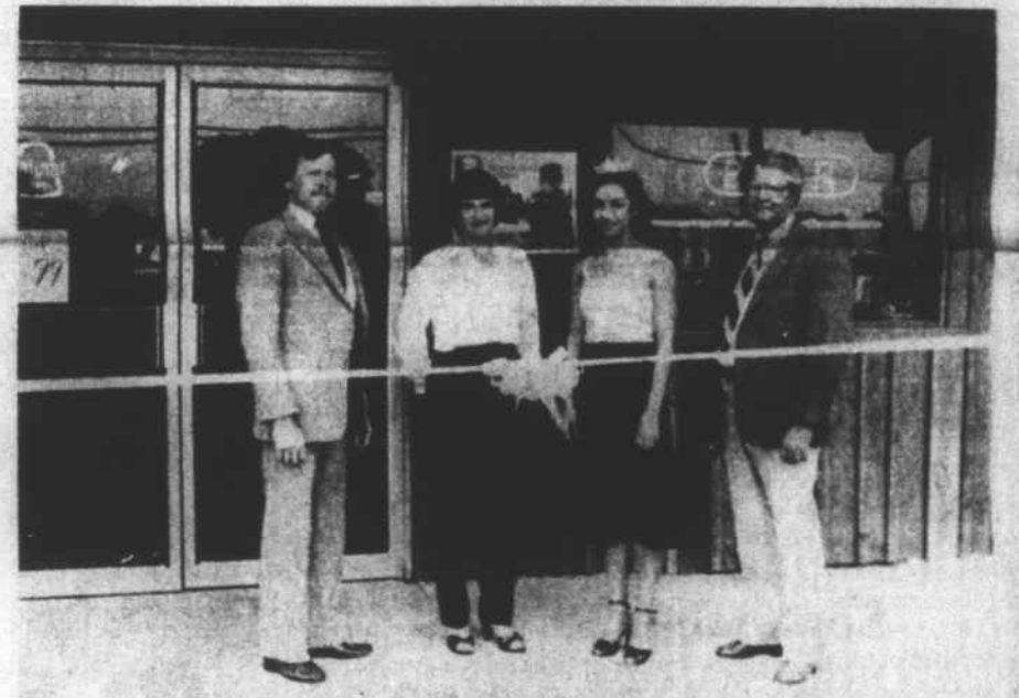
...participants in ribbon cutting