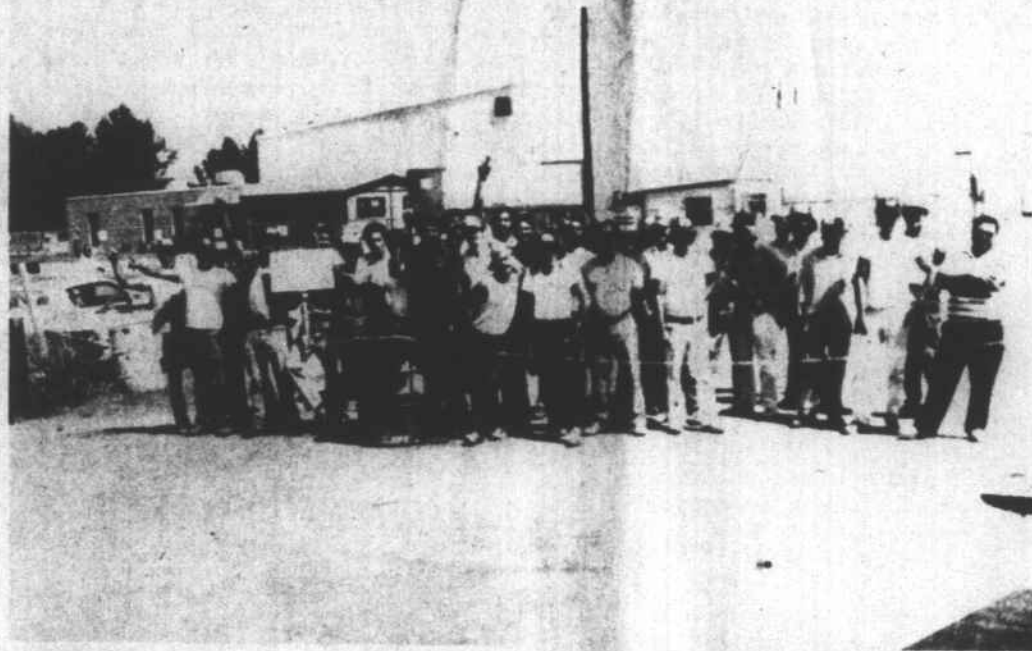
Disgruntled workers at Fleetwood Mobile Home plant in Pembroke are on strike because of cuts in pay. The workers are now beginning their second week on strike.

Company officials have held one generally unproductive meeting with a delegation of workers since the strike began.