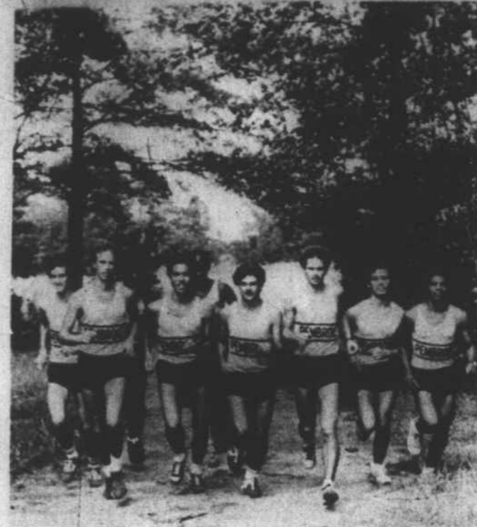
PSU Cross Country...Running at YOU! The 1982-83 season begins for the harriers at Campbell on Saturday. The