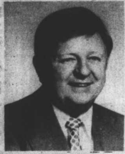
JOHN (PETE) HASTY House of Representatives