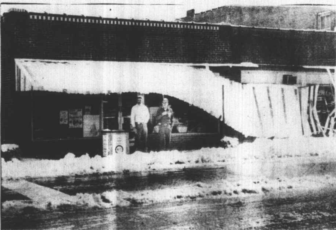
Pembroke Hardware's canopy collapsed underneath the weight of the unexpected snow.