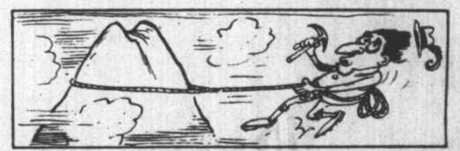
A cold spot - Mount Washington in New Hampshire clocked winds at 231 miles per hour one April day in 1934.

"Farming... a kind of continual miracle wrought by the hand of God." Benjamin Franklin