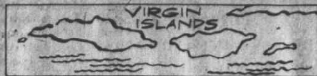
The United States bought the Virgin Islands from Denmark in 1917. The price tag: $25 million.