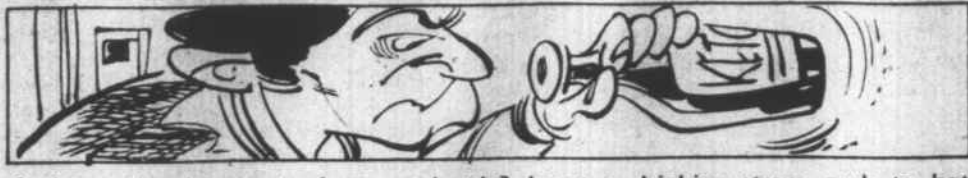
Can't get ketchup out of a new bottle? Insert a drinking straw, push to bottom and then remove. Enough air will be admitted to start the ketchup flowing.