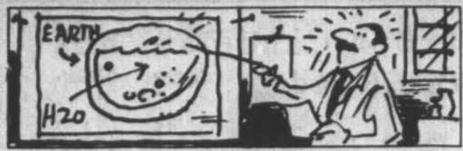
There is more water underground than the total of all the lakes and rivers in the world.