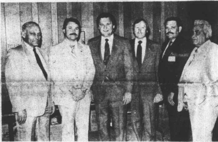
Gubernatorial candidate Rufus Edmisten toured Robeson County recently and stopped long enough to pose with some of his supporters at a stop at Lumbee Regional Development Association (LRDA) in Pembroke.