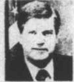
James G. Martin

DEMOCRATIC FRONT RUNNERS GOVERNOR'S RACE