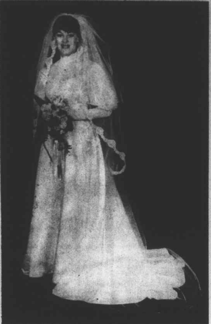
Sherry Revels Collins

Island Grove Baptist Church scene of Wedding