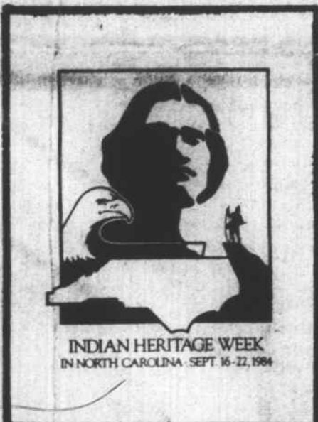
INDIAN HERITAGE WEEK IN NORTH CAROLINA - SEPT. 16-22, 1984