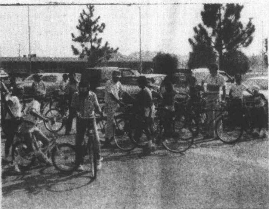
Bikers of all ages gathered at Pembroke Junior High School for the start of the event.