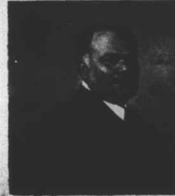
Bradford Oxendine District 3