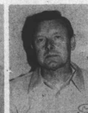
Curtis Willoughby Service Department

Sales Hours Mon.-Fri. 8 am - 7 pm Sat. 8 am - 5 pm Parts & Service Mon.-Fri. 8 am - 6 pm