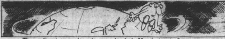
The earth rotates on its axis more slowly in March than in September.