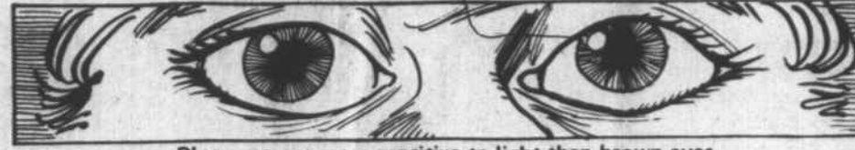
Blue eyes are more sensitive to light than brown eyes.