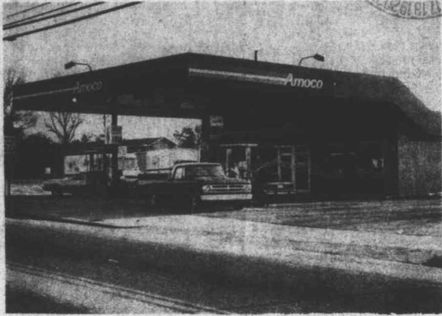
Woodell's Park and Shop back in old location... but in new quarters.