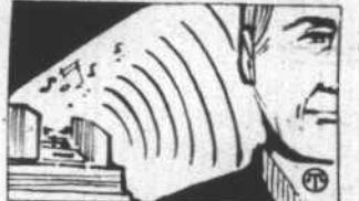
The average human ear can hear sound with frequencies between 20 and 20,000 vibrations per second.