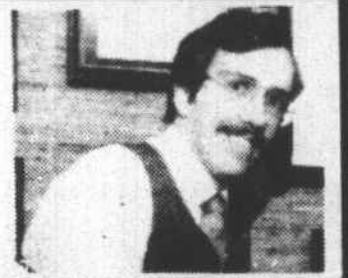
DOCTOR OF CHIROPRACTIC