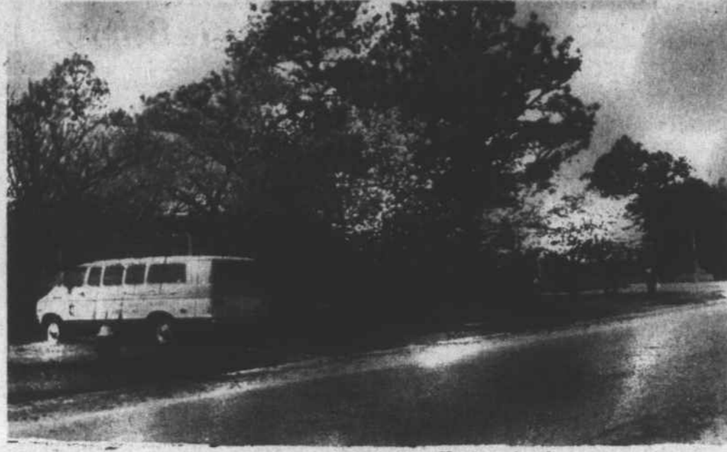
View of Dogwood Trees near Pembroke First Methodist Church.