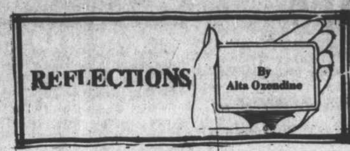
The Greatest Heartache

To me the greatest heartache is losing a loved one and not knowing that he or she was ready to go on to eternal life with the Lord. When you lose three-and you are not sure-you have a