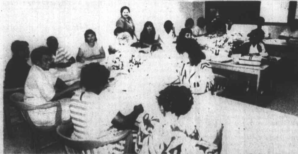
Twenty Robeson County teachers are shown participating in the recent Science and Mathematics Integrated

Say You Read It In The Carolina Indian Voice