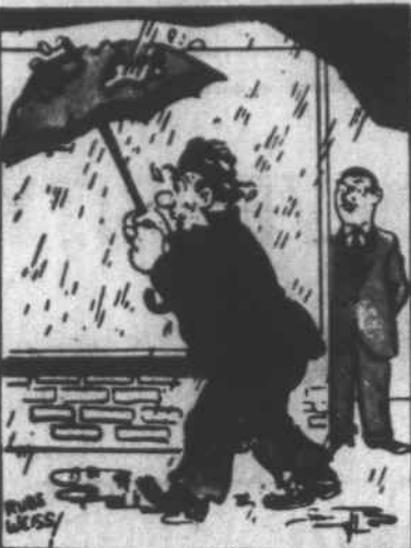
If you want to find out a man's real disposition, take him when he is wet and hungry.

FOR SNUFF THAT'S SWEET AS HONEY, GIVE HONEY BEE A TRY.