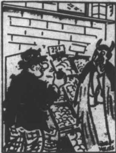
The devil owes most of his success to the fact that he is always around.