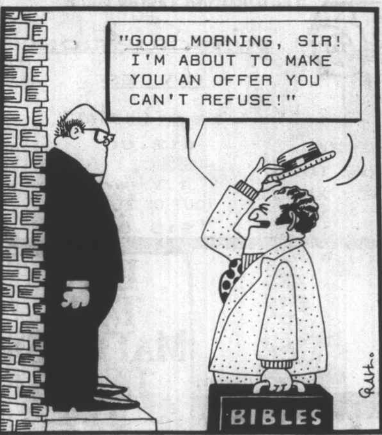
IT NEVER FAILS