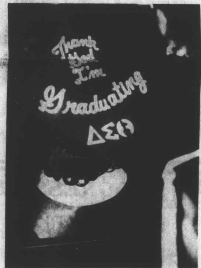
These words on the cap of one PSU graduate say it all at commencement Saturday.