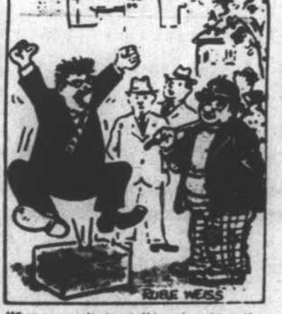
a man gits tew talking about himself,