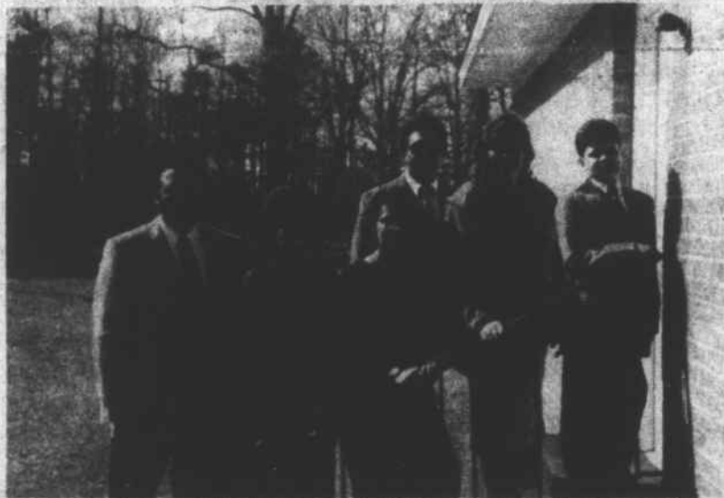
Performing at the LREMC Annual Meeting October 20 at PSU is the gospel group, The Hunts.

Pembroke State University will be the site of the 1992 Annual meeting of members of Lumbree River Electric Membership Corporation. Members will gather to hear yearly reports and elect members of their Board of Directors on October 20 with registration scheduled to begin at 6 p.m. at Givens Performing Arts Center, with the business meeting commencing at 7 p.m. Members must have registered to vote or must be in line to register by 8 p.m. in order to be