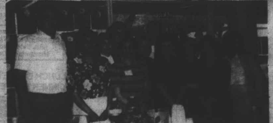
RATA Members of Pembroke Elem ary Hosted the March 25 Meeting.

Now you have the opportunity to give your input as well. Come and "Listen to the River" on Saturday, April 24, 1993 at 7:00 in Moore Hall.