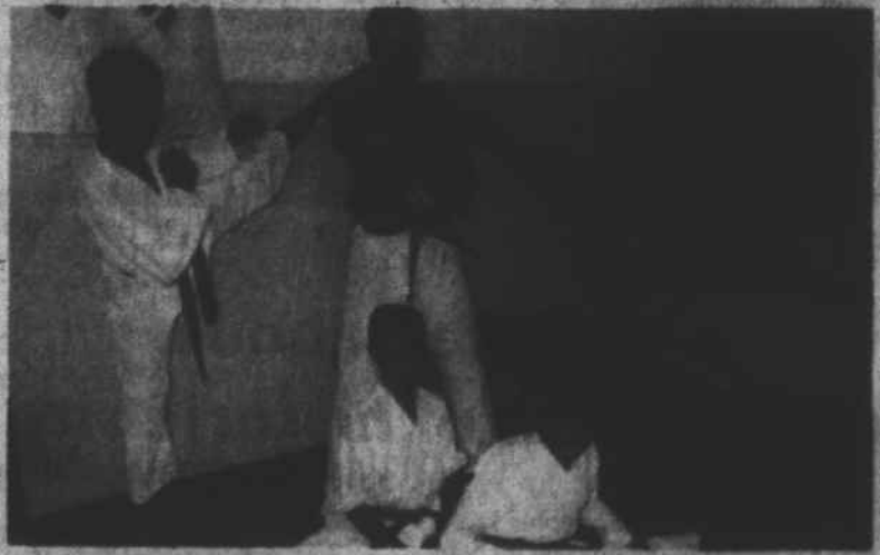
The newly earned green belt students at Tae Kwon Do demonstrate moves learned in the martial art.